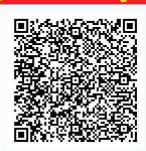
For DONATION via UPI. Please scan QR Code!