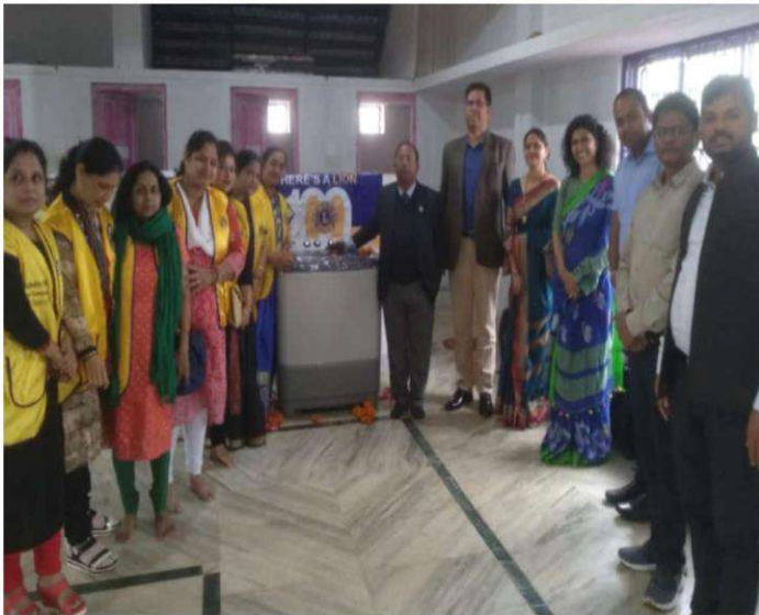
The Washing Machine donated by Lions Club of Bhubaneswar Lotus for Project Punarjivan.