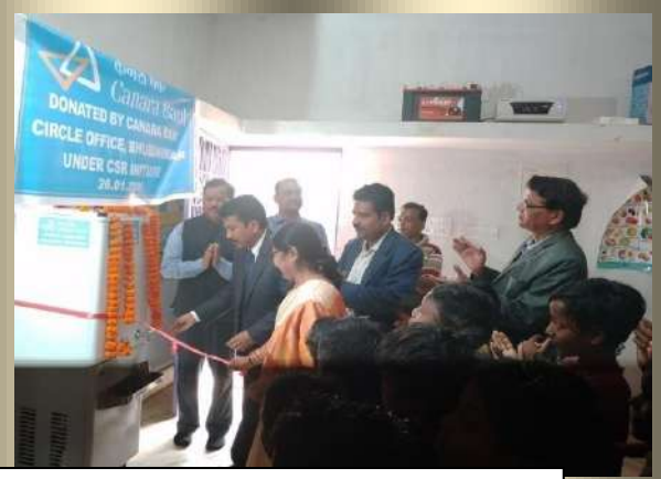
Water Cooler donated by Canara Bank for Project Punarjivan