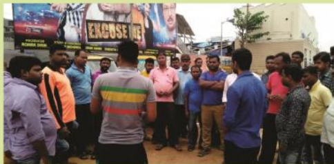
Sensitization And Awareness Meeting With Auto And Taxi Drivers At Bhubaneswar Railway Station