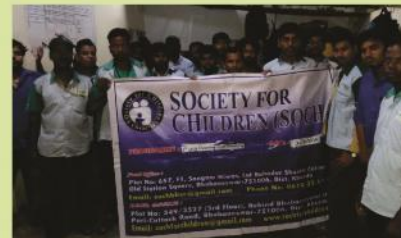
Sensitization Meeting With Cleaning Staffs At Bhubaneswar Railway Station