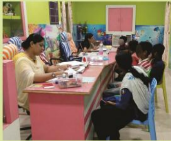
Children Produced Before Child Welfare Committee (CWC) At Puri