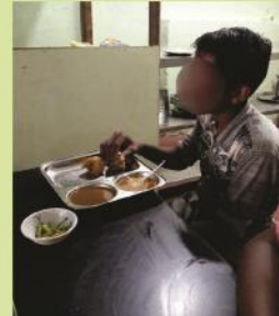
Nutrition Support To A Rescued Child At Bhubaneswar Railway Station