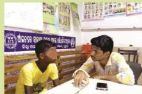
Counselling Assistance To A Rescued Child At Berhampur Counselling Center