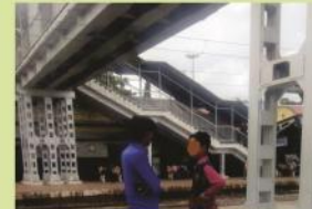
First Interaction With A Child At Berhampur Railway Station