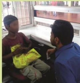
Counselling Assistance To A Rescued Child At Counselling Center, Puri Railway Station