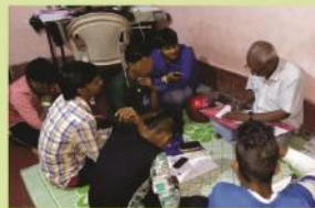
Single Member Sitting Of Child Welfare Committee (CWC) At Berhampur Counselling Center