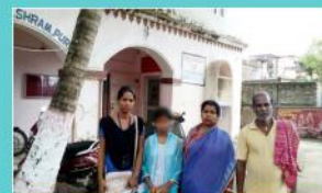
Rescued Child Reunited with Family after CWC production at Puri