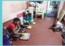
Nutrition Support to rescued children at Berhampur counselling centre