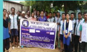
Sensitization and Awareness Meeting with Watering Staffs at Puri Railway Station