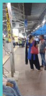
First interaction with a child at Bhubaneswar Railway Station