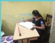
SOCH Staff Updating Daily Dairy Entry at GRPS, Bhubaneswar