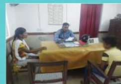
Interaction with Labour Officer regarding a child labour case