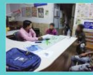
Single Member Sitting Of Child Welfare Committee (CWC) At Berhampur Counselling Centre