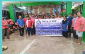
Sensitization and Awareness Meeting with Coolie Group at Bhubaneswar Railway Station