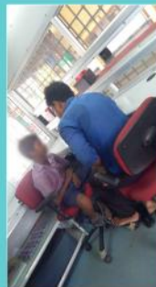
Counselling Assistance to a rescued child at Puri Railway Station