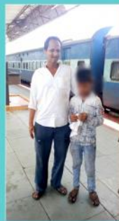
Child Referral received from stakeholder at Puri Railway Station