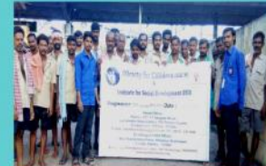
Sensitization and Awareness Meeting with Parcel Workers at Berhampur Railway Station.