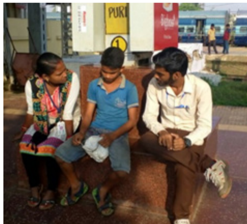
SOCH Outreach Worker and Volunteer interacting with Contacted Child at Puri Railway Platform during a 3 days Early Intervention Survey.