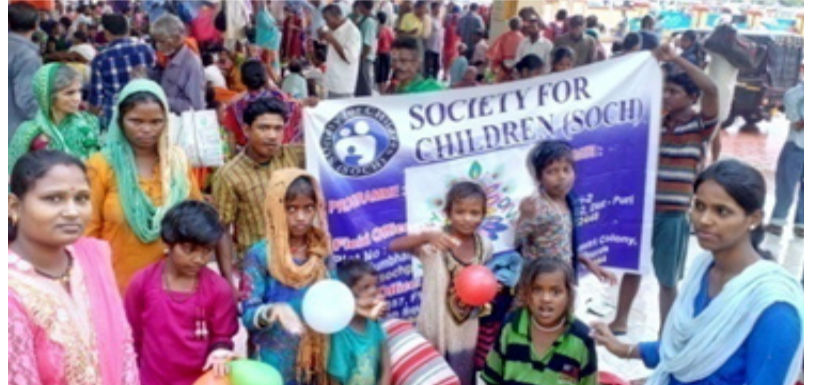
Diwali Celebration with Slum Children @ Puri Railway Station on 19th November 2017.