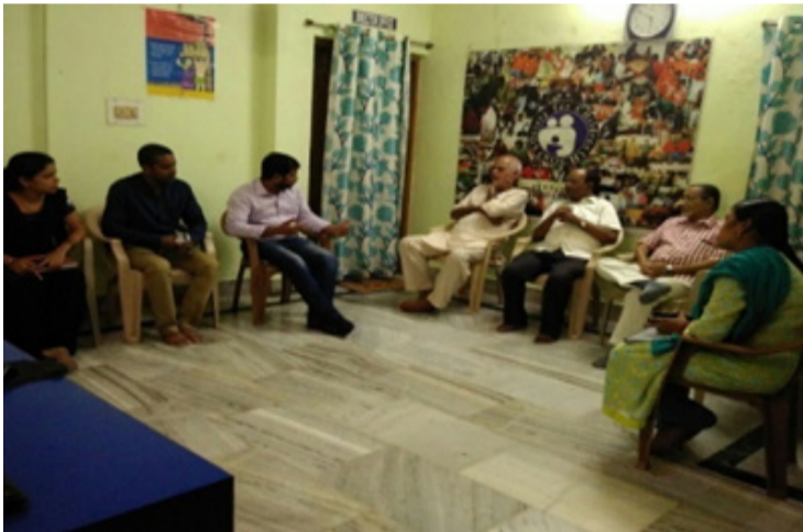
SOCH Team addressing to the queries from the members of the "Retire Person Group" in a meeting on 24th October 2017 @ SOCH Head Office, Bhubaneswar