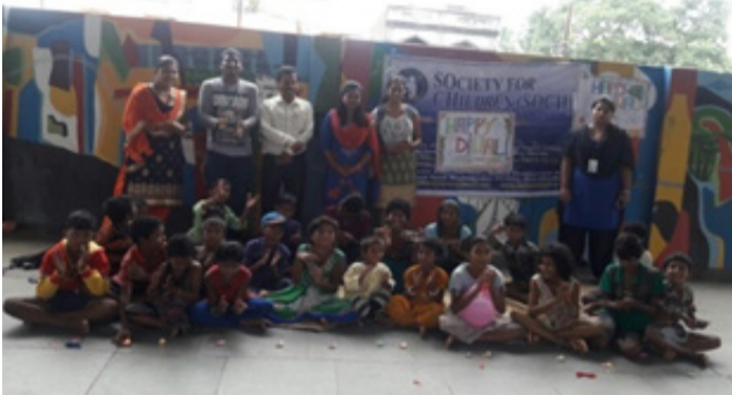
Diwali Celebration with Slum Children @ Bhubaneswar Railways Station on 19th November 2017.

www.sochforchildren.org \ facebook.com/sochforchildren \ sochforchildren@gmail.com