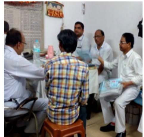
TTI Meeting @ Puri Railway Station on 28th October 2017.