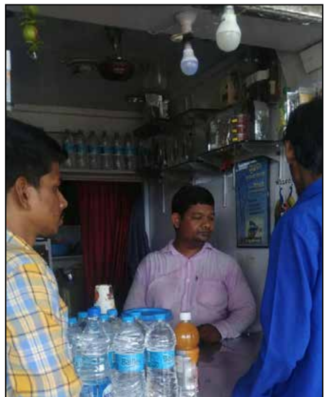
“ Near Shop and Vendor Sensitization meeting at Berhampur Railway Station ”