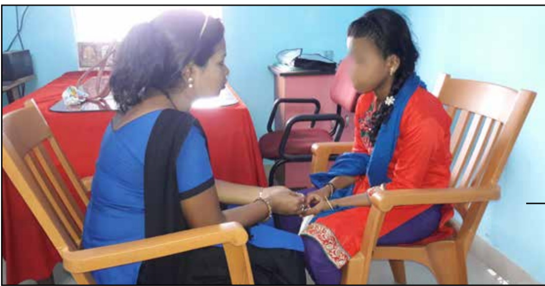
“ SOCH Social Worker cum Counsellor helping a rescued child with Counselling session at RPF Post, Bhubaneswar Railway Station ”