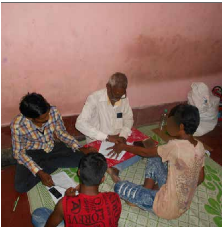
“ Child Welfare Committee (CWC) Single member sitting at SOCH Counselling Center, Berhampur ”