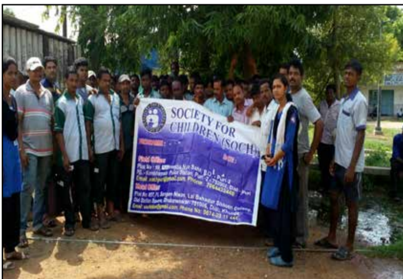
“ Sensitization and Awareness meeting with Watering staffs of Puri Railway Station. ”