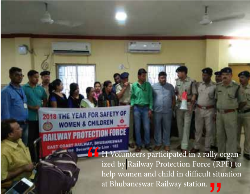
“ SOCH Volunteers participated in a rally organized by Railway Protection Force (RPF) to help women and child in difficult situation at Bhubaneswar Railway station. ”

www.sochforchildren.org / facebook.com/sochforchildren / sochforchildren@gmail.com