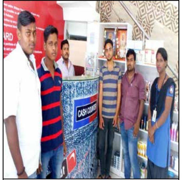
“ SOCH Donation Box being set up at the “Me-hers” Saree Showroom, Bhubaneswar and “The Family World Shopping Mall”, Puri ”