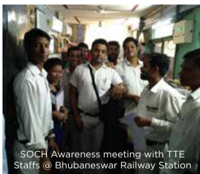
SOCH Awareness meeting with TTE Staffs @ Bhubaneswar Railway Station