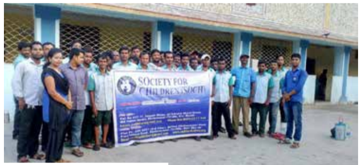
A group of 20-30 Cleaning Staffs of Bhubaneswar Railway Station attended SOCH Awareness meeting @ Bhubaneswar Railway Station