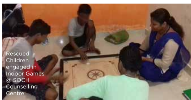
Rescued Children engaged in Indoor Games @ SOCH Counselling Centre