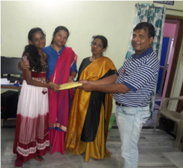
Members of "Friends of SOCH" (FOS), Bhubaneswar Chapter sharing a Token of appreciation in the FOS Regular Meeting