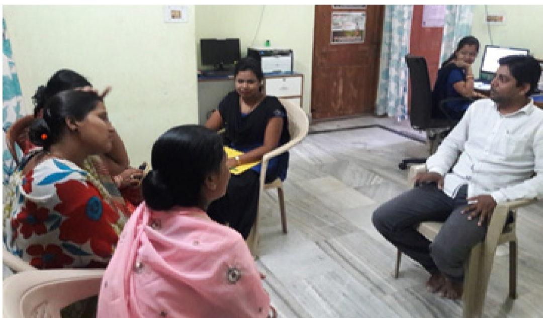
Orientation with prospective Lady Drivers for Project "Pankh Travels"