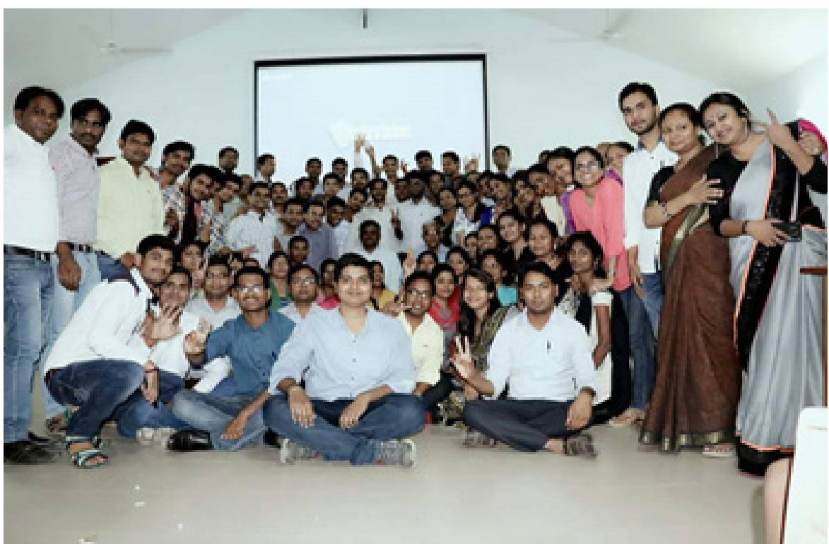
SOCH remained an Integral part of the "Sathi" Annual Day Celebration at Bangaluru