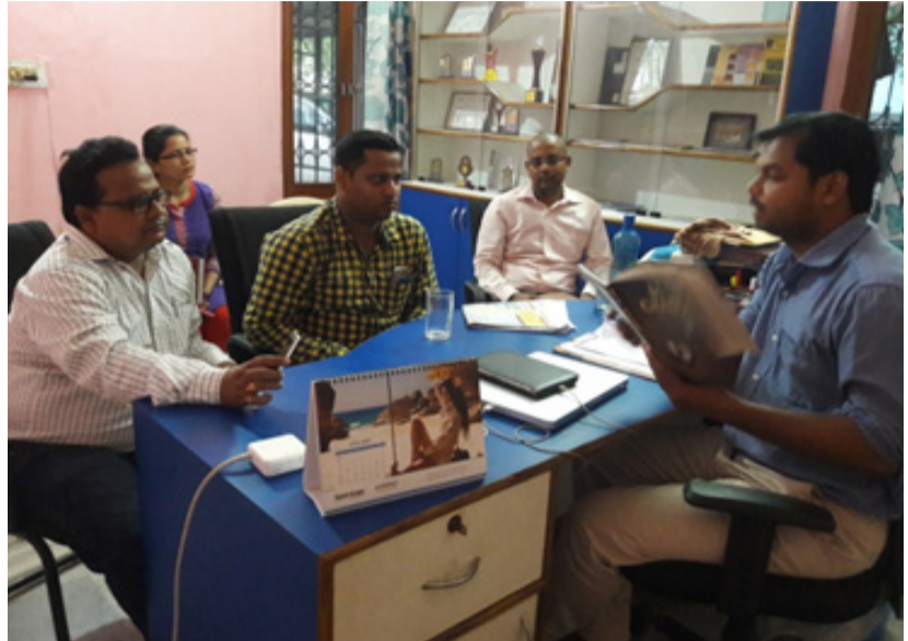
CSR Team from Reliance Foundation and SOCH Director discussing scope for association