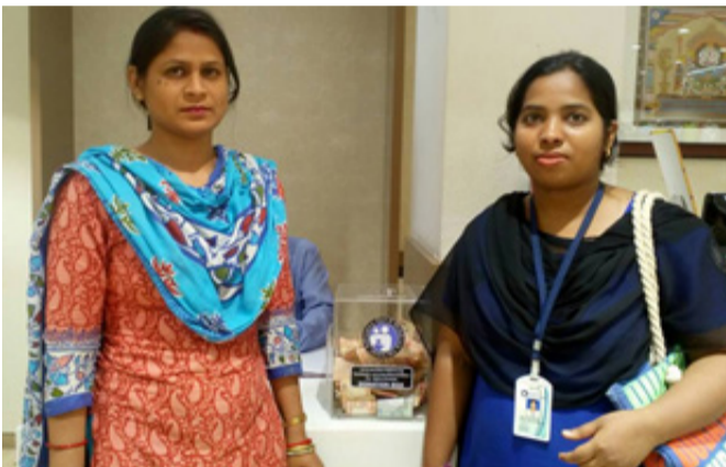
SOCH staff collecting donations received at Panda Travel Mart, Bhubaneswar