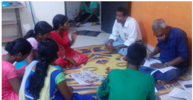
Child Welfare Committee (CWC) single member sitting at SOCH Berhampur Office